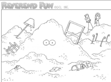
THE EXTRA FOOLISH MAN BUILDS HIS HOUSE ON THE SAND, USING SAND