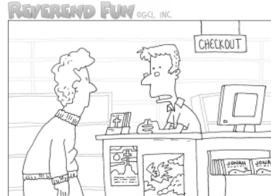
SORRY THIS IS A CHRISTIAN BOOKSTORE ... IT'S ALL NON-FICTION